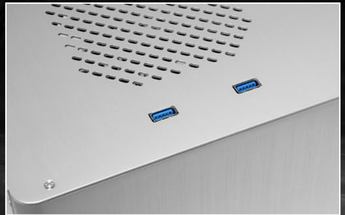
2x USB3.0 (internal 19-pin mainboard connector)