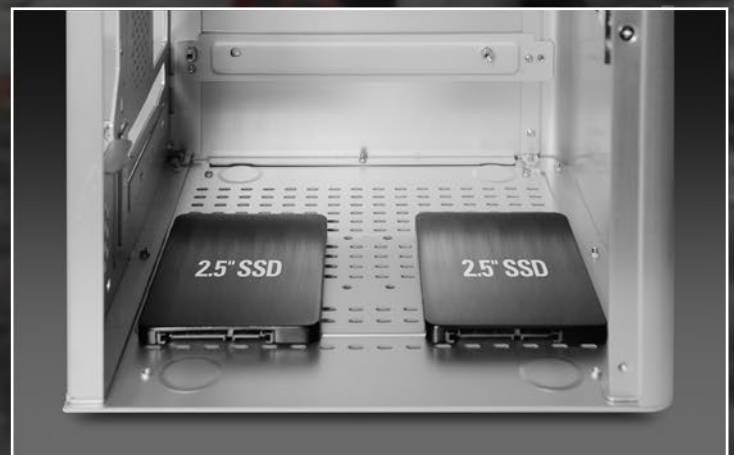
HDD/SSD mounting possibilities on the case floor