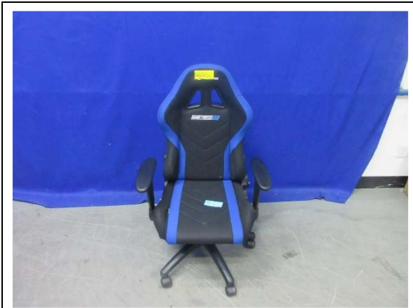
Sample as received - View 1