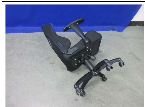
Sample as received - View 4

SGS authenticate the photo on original report only