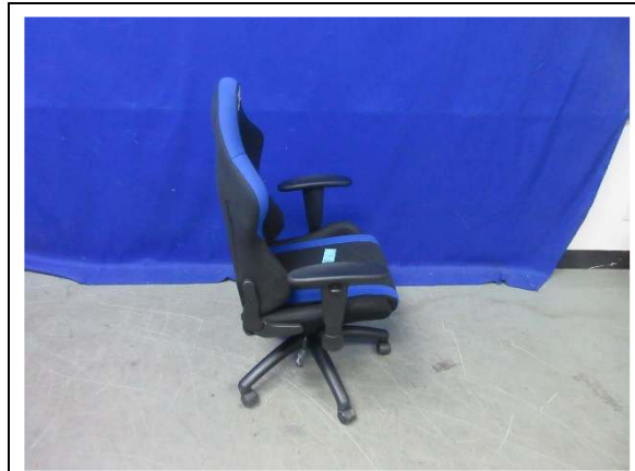
Sample as received - View 2