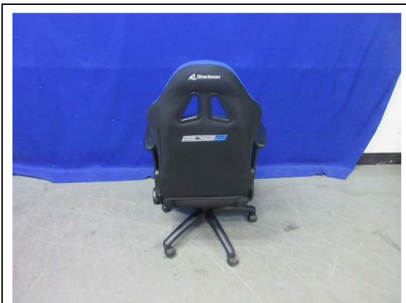
Sample as received - View 3